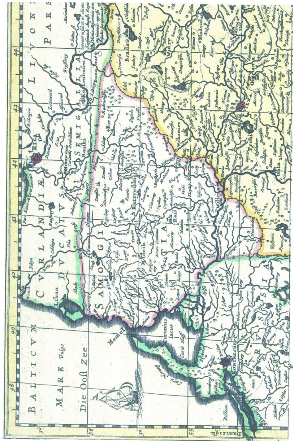
Figure 2. Fragment of N.C. Radziwil map